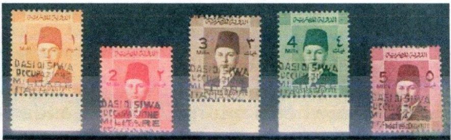
All low-value stamps of the Boy King issue were overprinted