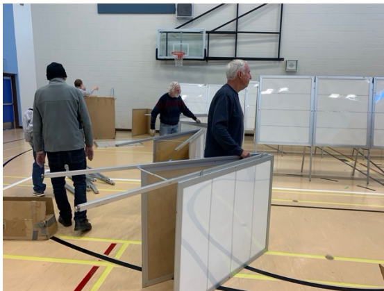
Setting up the Frames for Spring Show 2023